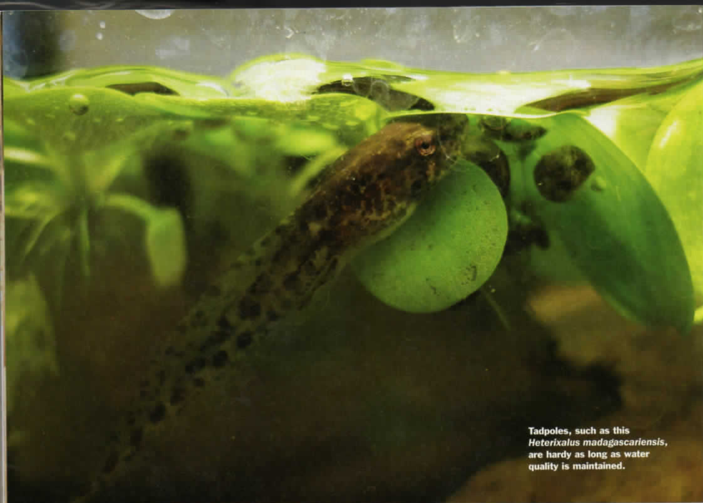
Tadpoles, such as this Heterixalus madagascariensis , are hardy as long as water quality is maintained.