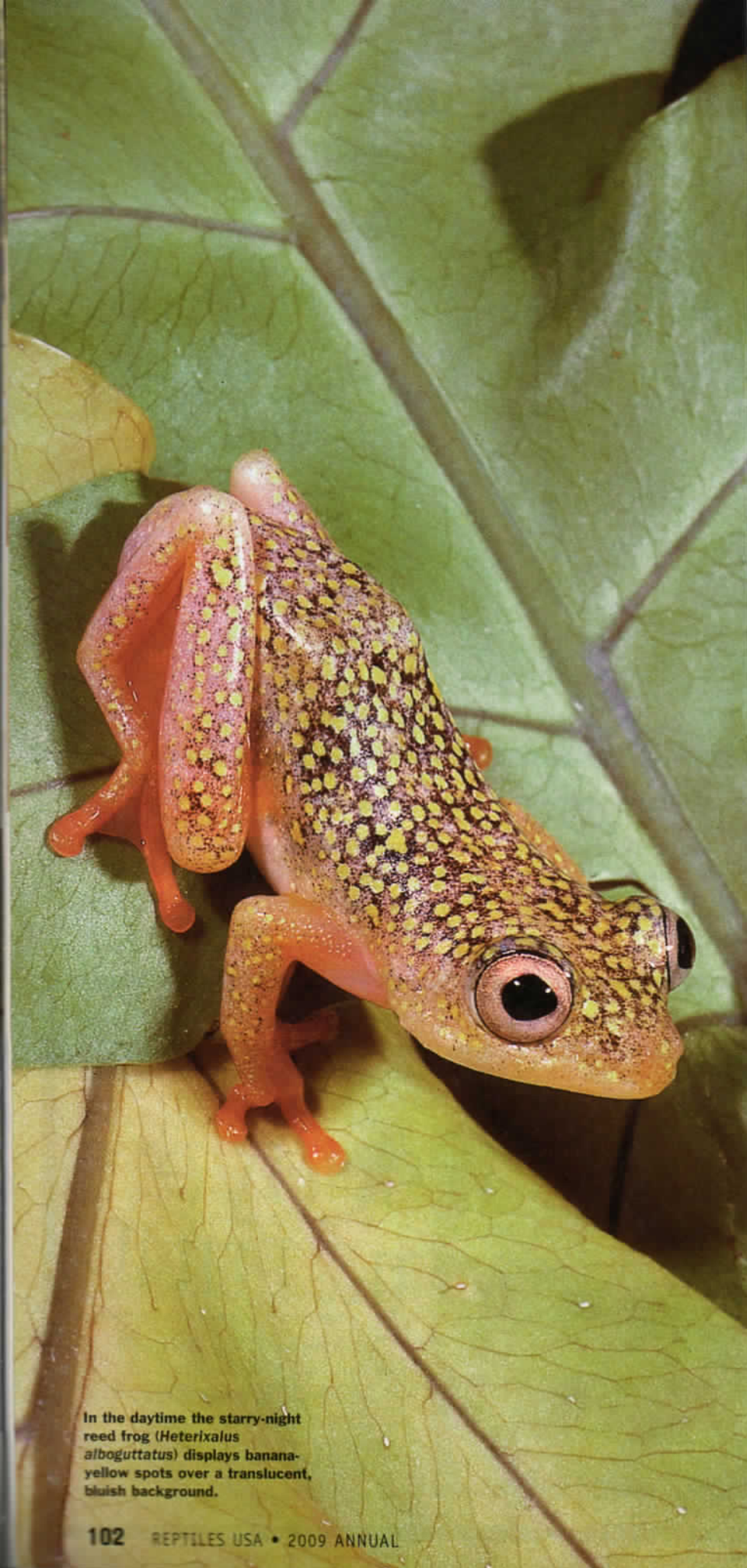
In the daytime the starry-night reed frog ( Heterixalus alboguttatus ) displays banana-yellow spots over a translucent, bluish background.

with solid silvery-white backs also exist. The only terrestrial frog known to feed on frog eggs in the wild, they live in moist savannas, bush lands, dry forests and grasslands.