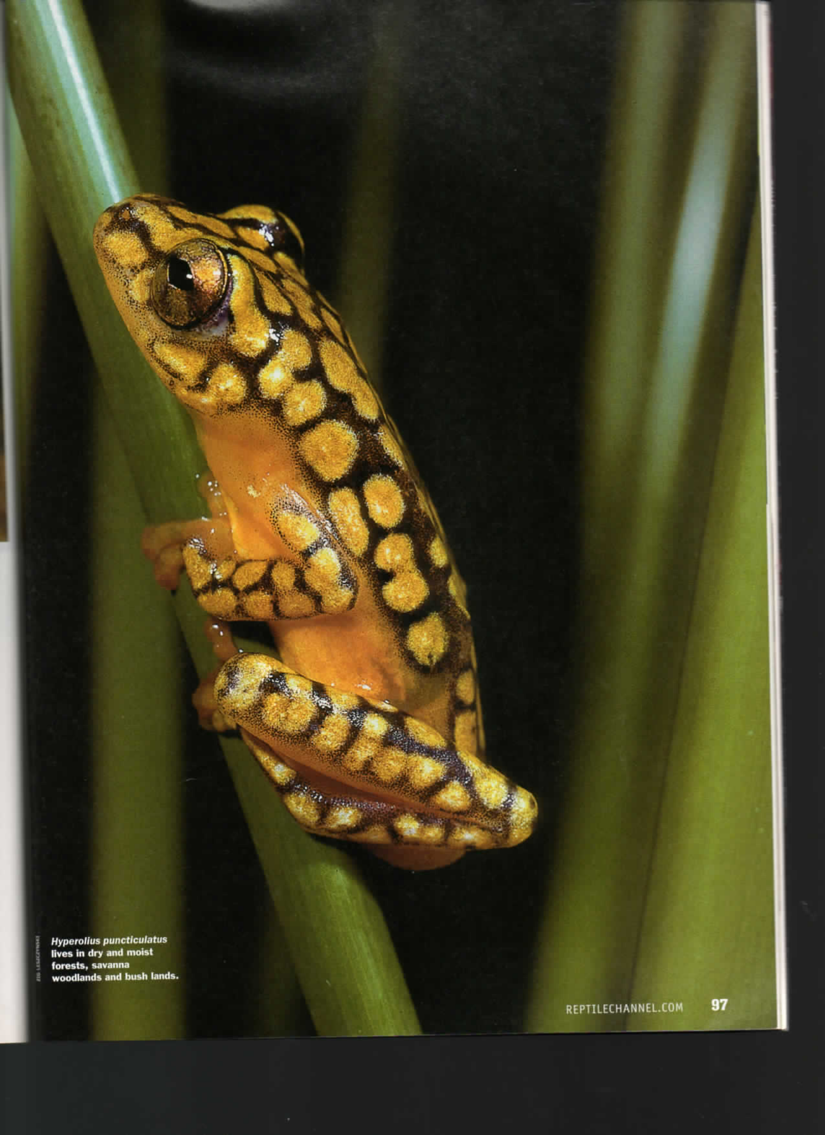
Hyperolius puncticulatus lives in dry and moist forests, savanna woodlands and bush lands.