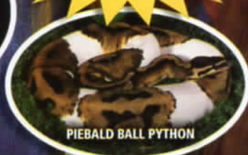
PIEBALD BALL PYTHON