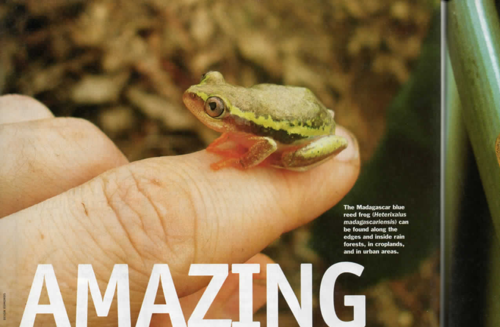
The Madagascar blue reed frog ( Heterixalus madagascariensis ) can be found along the edges and inside rain forests, in croplands, and in urban areas.