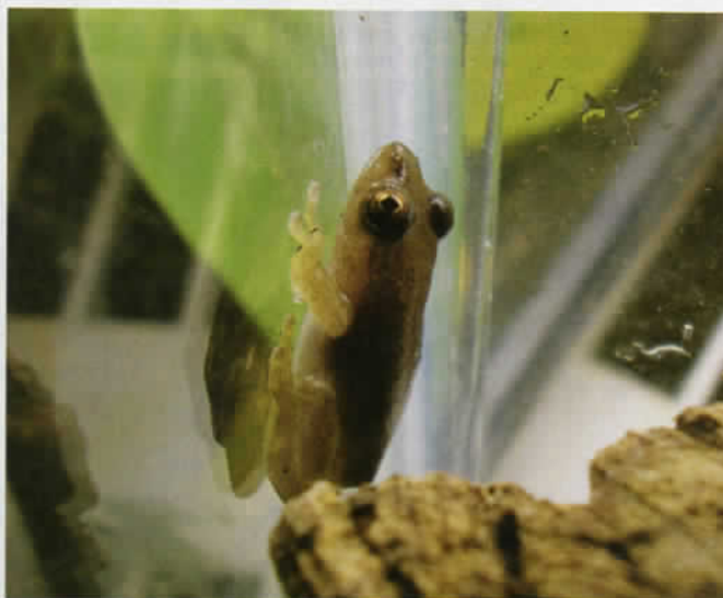
LEFT: Dots on the starry-night reed frog ( Heterixalus alboguttatus ) often appear during the day. RIGHT: At night, these daytime dots fade and transform the frog's color into a subdued brown. The species can often be found clinging to the sides of its enclosure.

Complement these moderately warm temperatures with varying levels of humidity. The terrarium should be misted every other day. Following a misting, the ambient humidity level can reach 100 percent, decreasing as the enclosure dries. Most reed frogs do not need high-humidity levels. These temporary increases should be enough to keep your frogs in good condition. Avoid stagnant or wet conditions.