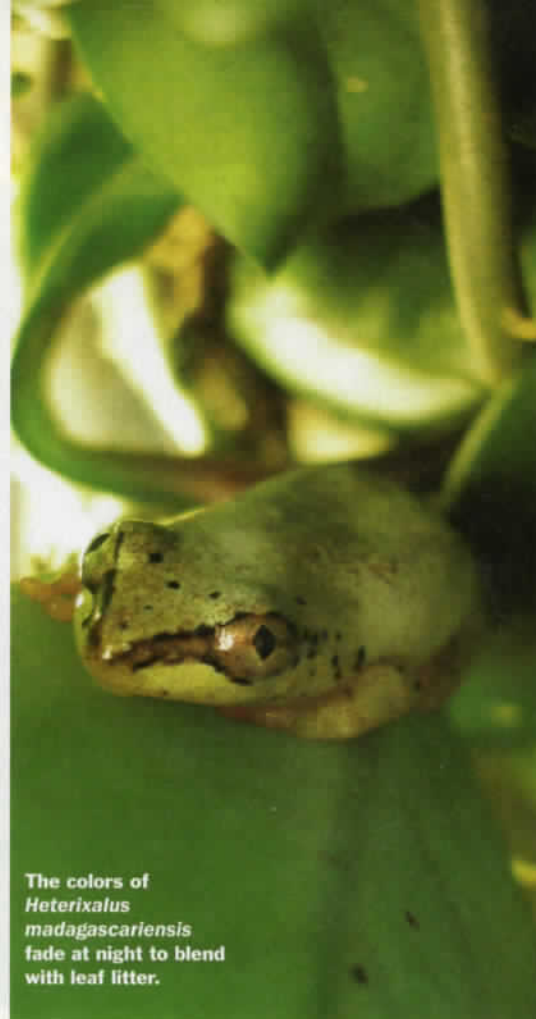
The colors of Heterixalus madagascariensis fade at night to blend with leaf litter.

coloration. This variability can make identifying species difficult. To add further to the confusion, certain Hyperolius species are sexually dimorphic to the extent that males and females look completely opposite one another.