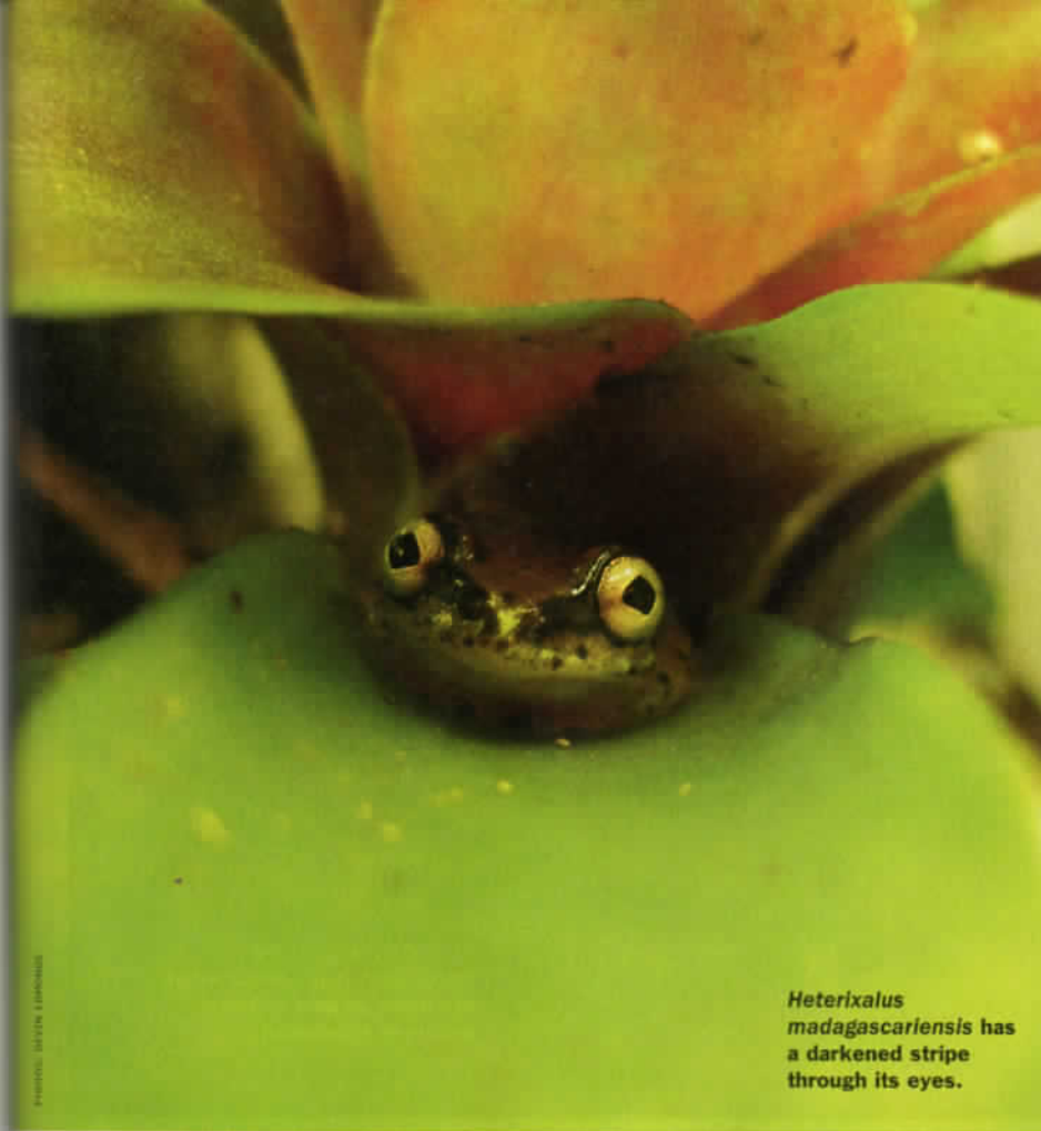
Heterixalus madagascariensis has a darkened stripe through its eyes.