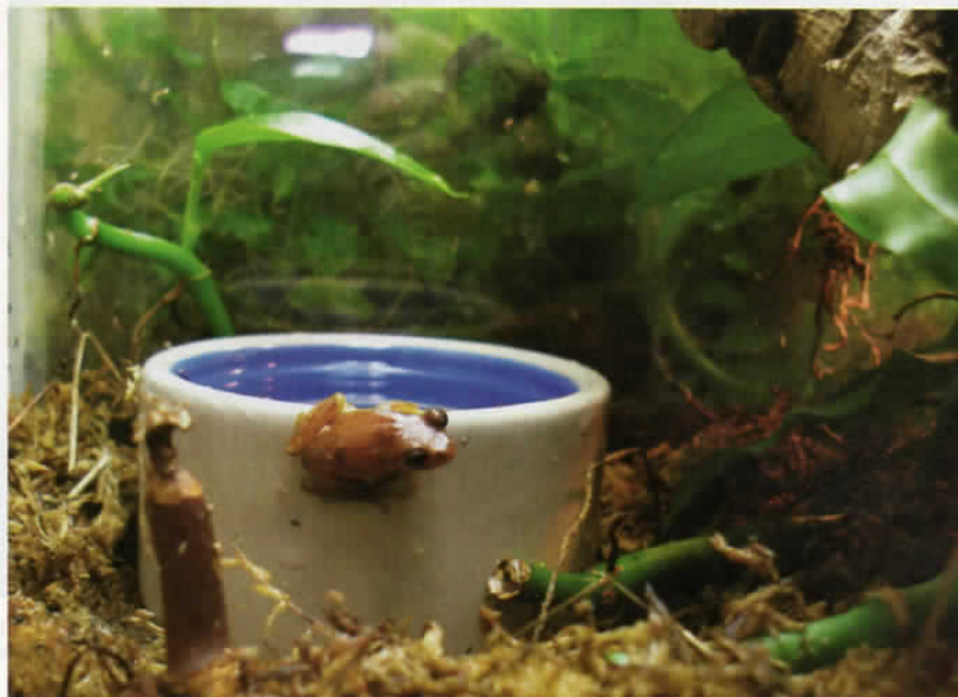
When filling a frog's water bowl, remember to use tap water treated with a water conditioner that removes chlorine and chloramines. You can find conditioners at most aquarium stores.

Live plants add aesthetics to reed frog housing, and they serve as resting spots for frogs while they sleep during the day. Although they aren't required, it seems like a waste to have a brightly lit enclosure designed for small, colorful frogs without also a carefully planned landscape full of live plants. Common houseplants such as philodendron, Scindapsus and Sansevieria plants, bromeliads, and small Calathea plants are all good options. You might like to seek out dwarf or miniature plant varieties from specialty terrarium supply companies. Thoroughly wash plants before use and grow them outside the terrarium for several weeks to allow fertilizers, leaf