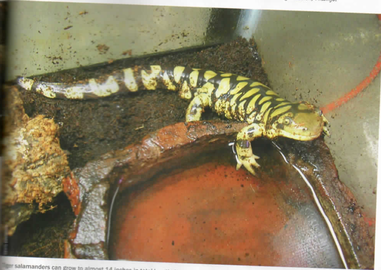
Some salamanders can grow to almost 14 inches in total length, but most stay smaller.