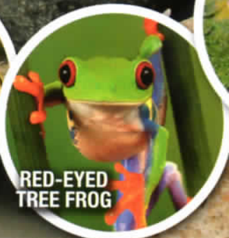
RED-EYED TREE FROG