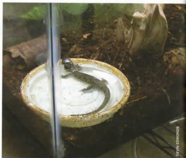
Tiger salamanders are not particularly active. A 15-gallon aquarium is large enough for one adult.

Tiger salamanders can grow to almost 14 inches in total length, but most stay smaller. Though they are large amphibians, they are not particularly active and spend most of their time under cover, waiting for food to arrive. A 15-gallon aquarium is large enough for one adult. A substrate around 3 inches thick of coconut husk fiber blended 50/50 with cypress mulch works well, but take care to provide a moisture gradient within it so that the bottom portion stays damp while an area to one side or on top is dryer. You can achieve this by pouring a little water into the enclosure once a week or as needed, but take care to avoid soggy or water-logged conditions.