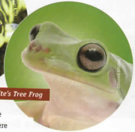
White's Tree Frog

It is good practice to always wash hands before and after holding any amphibian, and to avoid touching your eyes, mouth or nose while doing so. Although the words "poison" and "pet" used together may cause alarm, there is little need to be concerned so long as you don't eat your pets. In fact, there is usually more risk to the pet than to the person. The oils, salts and possible residues from soaps or detergents found on human skin are irritating and harmful to amphibians. When handling is necessary, make sure your hands are wet. You can also examine and transport amphibians within a moist net or small plastic container, which is the best option of all.