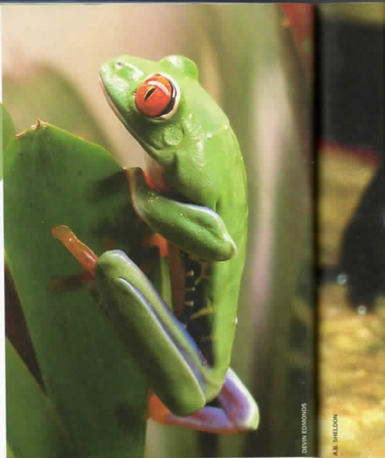
The red-eyed tree frog's stunning coloration varies with its origin in Central America, but typically, it has tomato-red eyes, tangerine-orange feet and sides that are patterned in beautiful blue bands.

Adult red-eyed tree frogs measure between 2 and 3 inches in length, with females usually noticeably larger than males by at least half an inch.