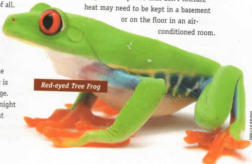
Red-eyed Tree Frog

For all of these five favorite pet amphibians, make sure there is an accurate thermometer within their enclosure so you can monitor the temperature. If heating is needed, use a low-wattage incandescent light bulb, or a fully submersible aquarium heater with thermostat if there is a large water area. Generally, hot rocks, heating pads and heat cables are more appropriate for heating reptile housing than for amphibians. Cooling an enclosure is more difficult than heating one, so species that don't tolerate heat may need to be kept in a basement or on the floor in an air-conditioned room.